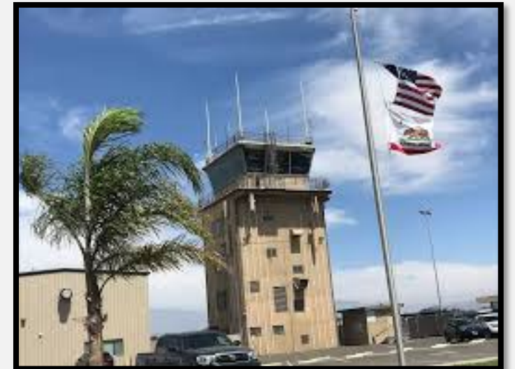
Highlighting the Partnership Between the Department of Airports and Air Traffic Control Tower Teams